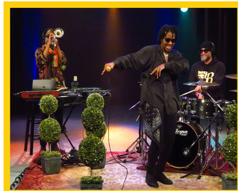
Inland Sessions showcases talented performers living in the Inland Northwest. Inland Sessions provides a venue for regional musicians and spoken-word artists performing in the KSPS PBS studios.