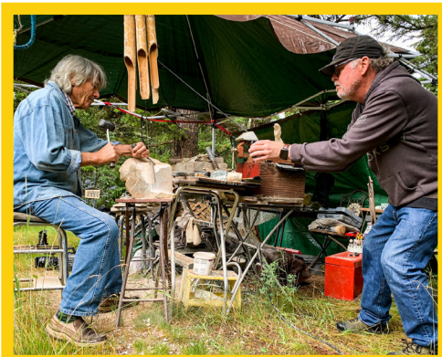
Northwest Profiles is KSPS PBS' flagship program, highlighting the most inspiring people, places and events throughout our region.

Overall, our efforts to promote local artists and arts and culture organizations have had a significant impact, raising awareness and appreciation for the artistic and cultural richness of our communities. We are proud of the work we have done and look forward to continuing to support and celebrate the talent and creativity of our region.