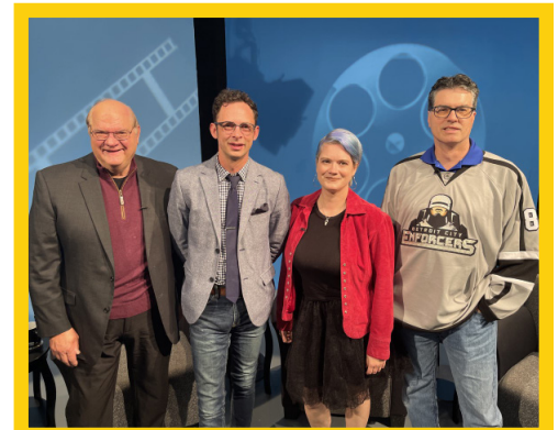
We all love a good movie, and KSPS PBS loves to bring them to you! Featuring little-known films and blockbusters alike, Saturday Night Cinema showcases dramas, comedies, mysteries, musicals and more, with film introductions and commentary by KSPS PBS hosts who are avid movie buffs.