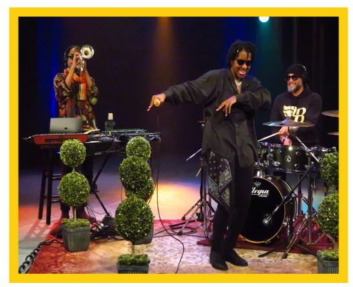
Inland Sessions showcases talented performers living in the Inland Northwest. Inland Sessions provides a venue for regional musicians and spoken-word artists performing in the KSPS PBS studios.