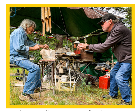
Northwest Profiles is KSPS PBS' flagship program, highlighting the most inspiring people, places and events throughout our region.

Overall, our efforts to promote local artists and arts and culture organizations have had a significant impact, raising awareness and appreciation for the artistic and cultural richness of our communities. We are proud of the work we have done and look forward to continuing to support and celebrate the talent and creativity of our region.